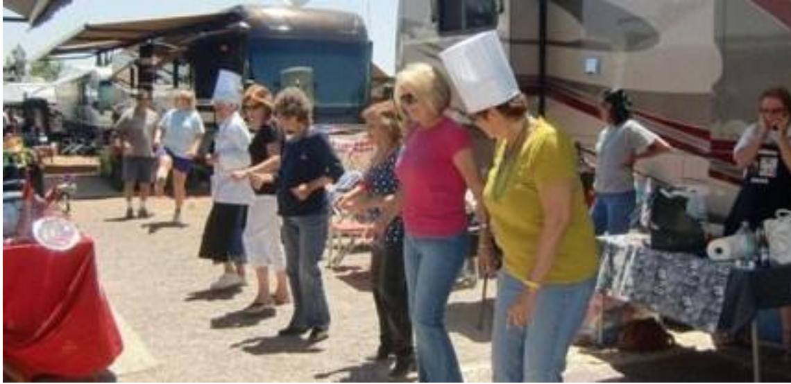
Line dancing for the Kokopili Too show....looks like fun!