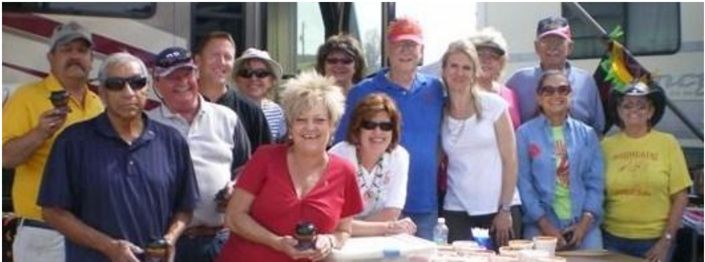
Nick's Place winners!!!