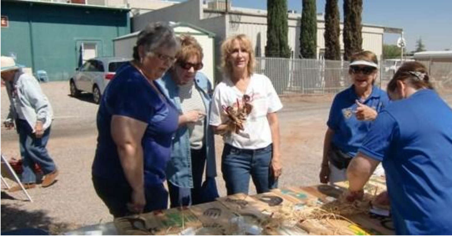
The Just for Kids & Kiwanis getting trophies ready!