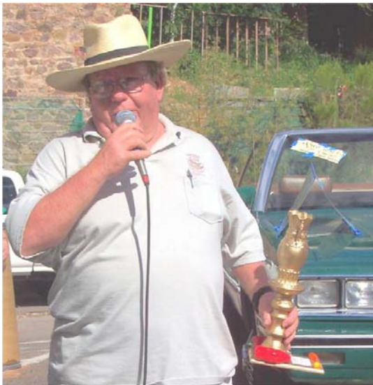
Guy Has Something To Say