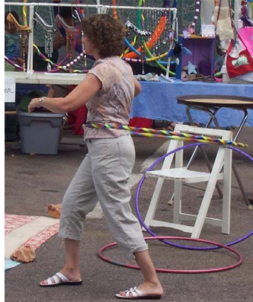
Hoola Hoops in Bisbee