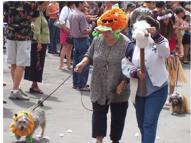
Where Else But Bisbee????